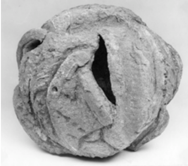
Materials: Clay Size: 50cm high x 50cm, wide