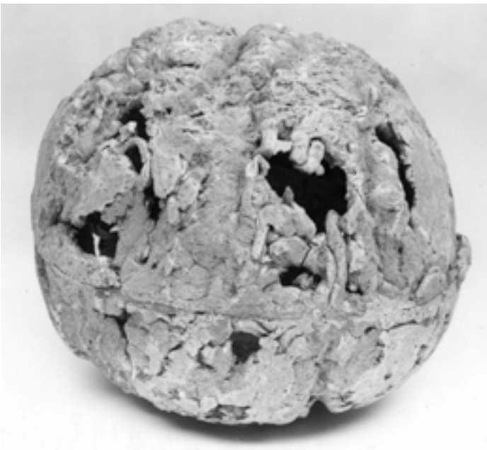
Materials: Clay Size: 45cm high x 45cm wide