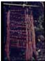
Materials: Horsehair and dyed sisal fibre Size: 350cm high x 185cm wide