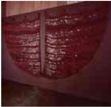
Materials: Dyed jute and cotton fibre. Ceramic discs woven in. Size: Each side 200cm high x 250cm wide.