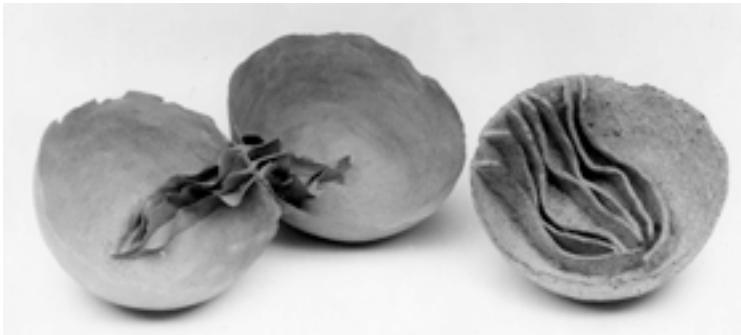
Materials: Clay Size: each bowl approx 30cm across

Here are a very few pieces of work I did while at Wolverhampton Polytechnic; 1972 – 1975. I was doing a three dimensional course, majoring in ceramics; however, while at college I discovered fibre and weaving and spent the last two years experimenting with combining the two media, increasingly using more fibre than clay.