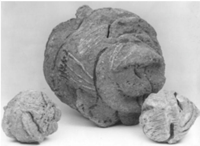
Materials: Clay Size. Large piece 50cm high x 50cm wide. Small pieces 20cm high x 20cm wide