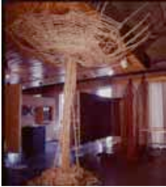
Materials: Clay inner piece. Sisal and jute fibres. Size: approx. 250cm high x 180cm wide