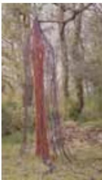
Materials: Dyed soft jute and linen fibres Size: 250cm high x 80cm wide