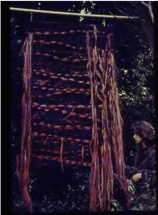
Materials: Horsehair and dyed sisal fibre Size: 350cm high x 185cm wide