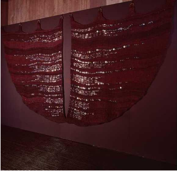
Materials: Dyed jute and cotton fibre. Ceramic discs woven in. Size: Each side 200cm high x 250cm wide.