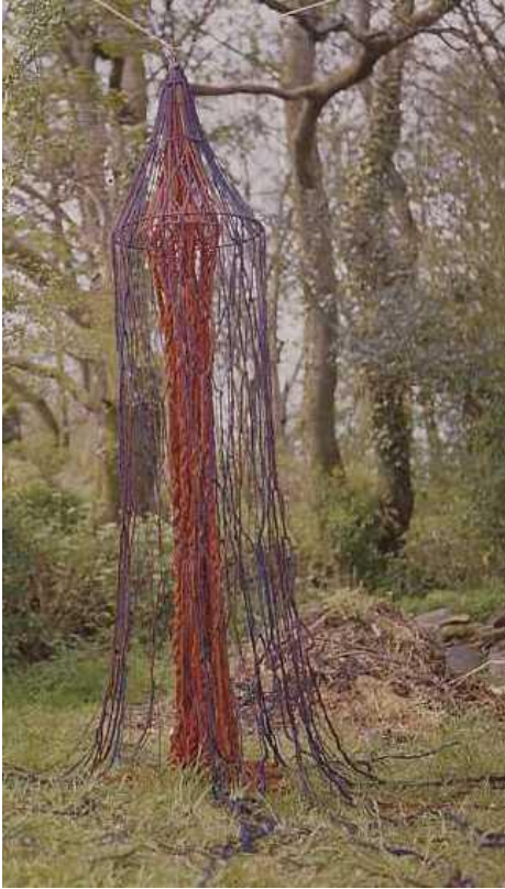
Materials: Dyed soft jute and linen fibres Size: 250cm high x 80cm wide