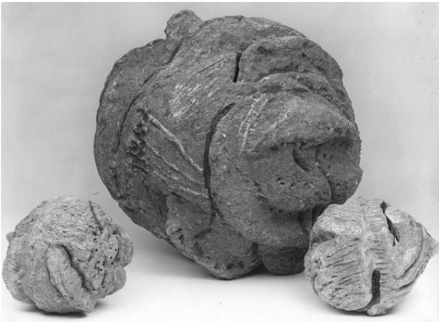
Materials: Clay Size. Large piece 50cm high x 50cm wide. Small pieces 20cm high x 20cm wide