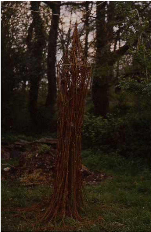
Materials: Dyed linen string. Ceramic globes suspended within Size: 250cm high x 60cm wide