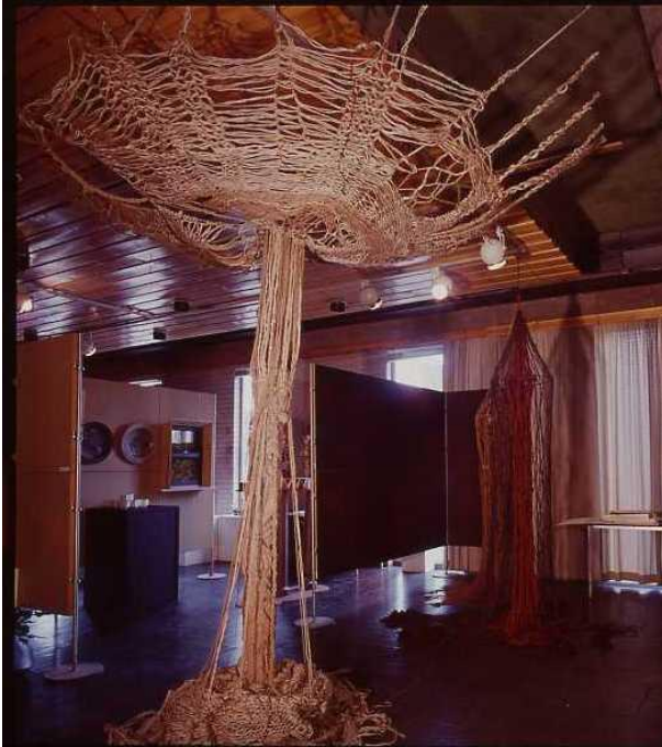
Materials: Clay inner piece. Sisal and jute fibres. Size: approx. 250cm high x 180cm wide