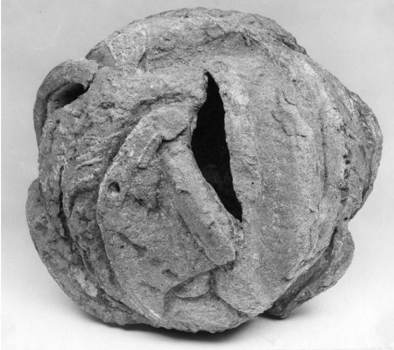
Materials: Clay Size: 50cm high x 50cm, wide