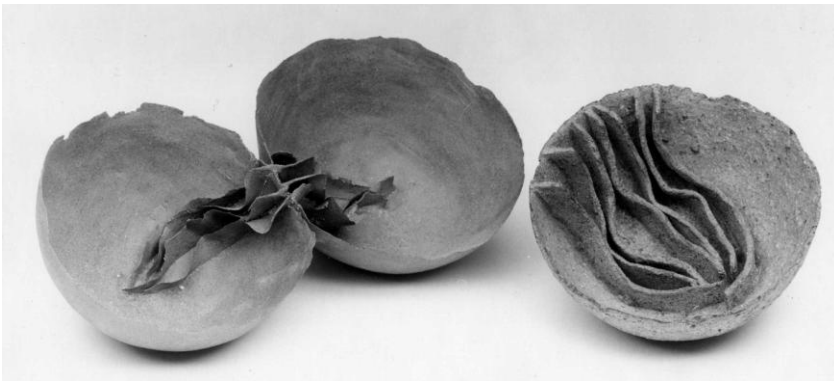
Materials: Clay Size: each bowl approx 30cm across

Here are a very few pieces of work I did while at Wolverhampton Polytechnic; 1972 – 1975. I was doing a three dimensional course, majoring in ceramics; however, while at college I discovered fibre and weaving and spent the last two years experimenting with combining the two media, increasingly using more fibre than clay.