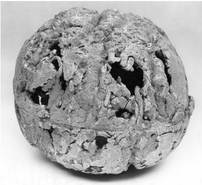
Materials: Clay Size: 45cm high x 45cm wide